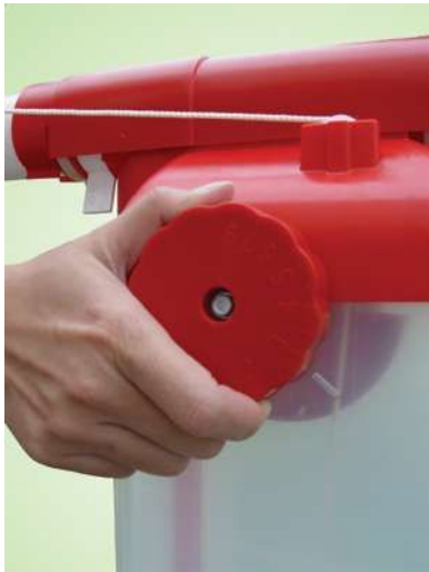
Adjustable Scale Knob